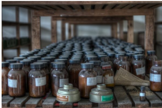
Dolphin Bay has added copper azole to its range of wood preservative products.

Dolphin Bay has added copper azole to its range of wood preservative products, offering customers an even broader choice and broadening their opportunities to export.